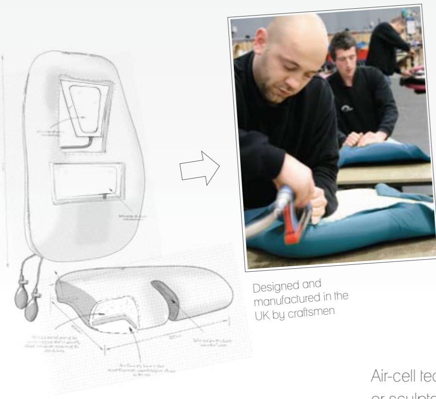
Designed and manufactured in the UK by craftsmen

We form each chair around your measurements , working alongside an Occupational Therapist, Physiotherapist or Assessor.