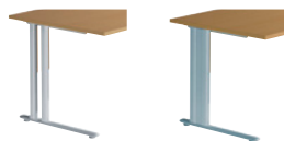
Cantilever C leg Equipped C leg