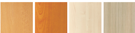
A MFC Beech B MFC Cherry C MFC Maple F MFC Light oak